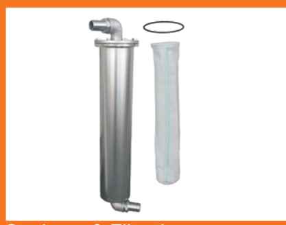
Strainers & Filtration.