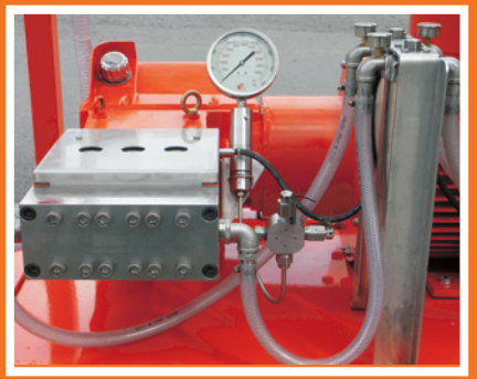
Stainless steel pump-head.