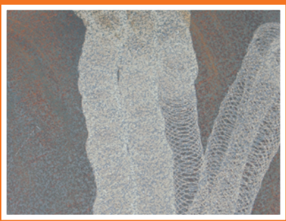
Water Blasting With Rotating Nozzles.