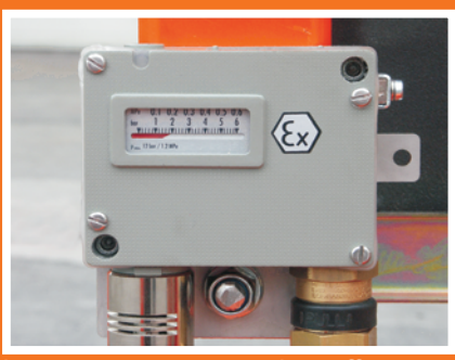
Low pressure pump shut-off.